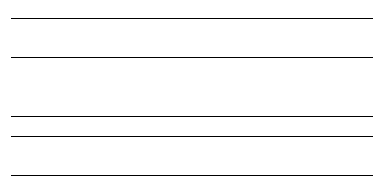
Which arrondissement would you rather live in? Why? What sets it apart from the others? What monuments are located in your favorite part of Paris? Find one other interesting fact about your favorite arrondissement. Please answer in English in paragraph form and use complete sentences.